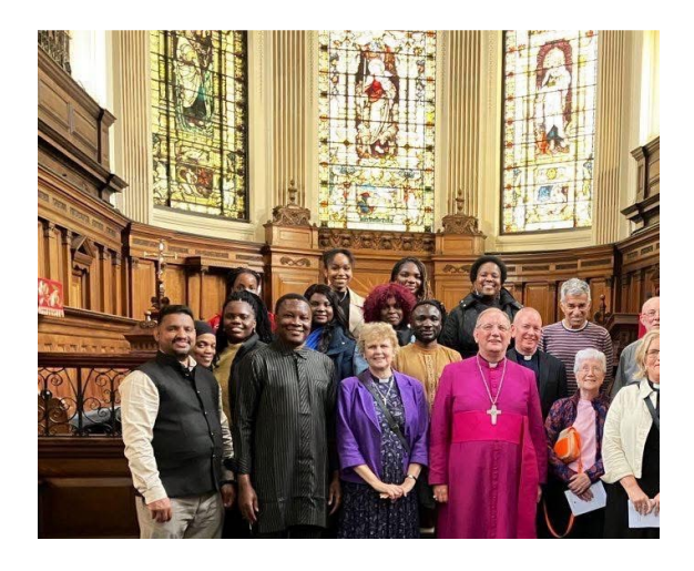
The first photo is all those who represent GMCT or who took part in the service